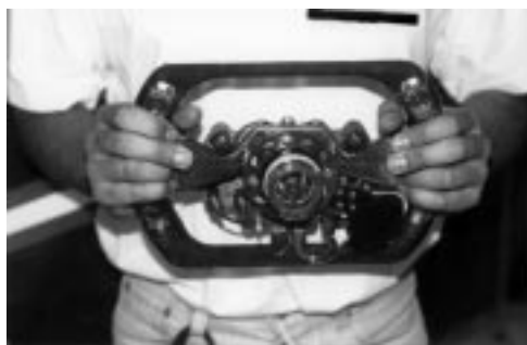
Figure 1 Back view of the bear hand grip on the steering wheel. Note the semiautomatic gear change which is controlled with the long finger on the right hand.

flexion-extension as well as in prosupination was noted. Palpation of the joints identified areas of tenderness, which were related to the intercarpal intervals—that is, the spaces between the scaphoid and the lunate, and the lunate and the triquetrum. The Kirk Watson test 5 assessed scapholunate instability. The Reagan shuck test was used to look for peritriquetral instability. 6 Finally a midcarpal instability sign was looked for.